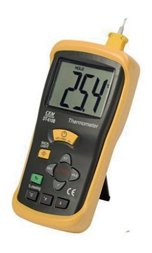
Fig. 1.2 for Question 1 Digital thermometer